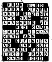
Solution to Last Saturday's Crossword

Annual meeting of the rate payers of Whim Road School District took place on Tuesday June 30.