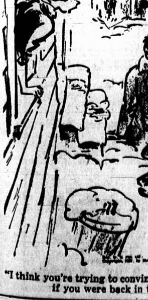
"I think you're trying to convince me that you'd be safer if you were back in the Air Force."