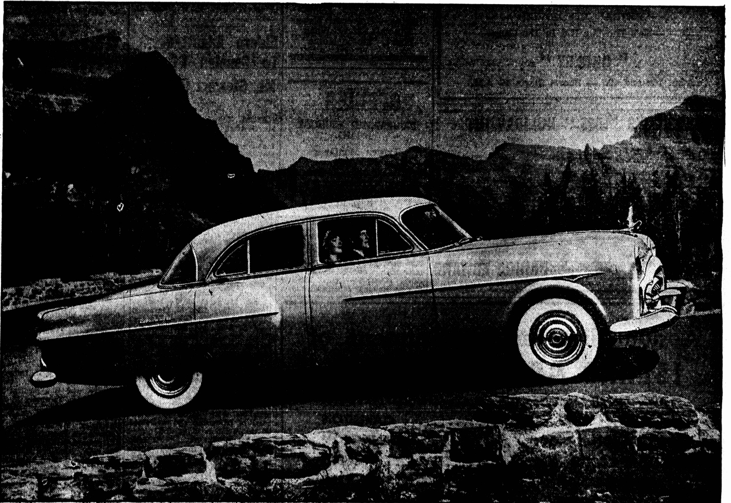
Car details as shown are subject to change without notice