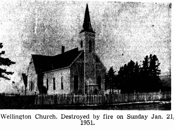
Wellington Church. Destroyed by fire on Sunday Jan. 21, 1951.