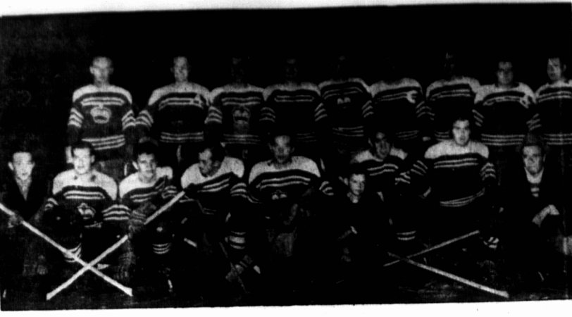
Above is West Prince All-Stars who won the Island M.A.H.A. Intermediate "B" championship in Alberton Saturday night by turning back Freetown Royals 11-6 in the fifth and deciding game of the final round. The All-Stars now meet Amherst St. Pats in Maritime playdowns.