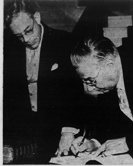
CABINET MEETING DAY CANCELED

OTTAWA (CP) — Fisheries Minister J. Angus MacLean said today that the annual meeting of the Fisheries Research Board of Canada would open in Ottawa. The Quebec MP said that there has been a steady increase in the number of fishery grounds as their own Fisheries Minister J. Angus MacLean said today that the annual meeting of the Fisheries Research Board of Canada would open in Ottawa. The Quebec MP said that there has been a steady increase in the number of fishery grounds as their own Fisheries Minister J. Angus MacLean said today that the annual meeting of the Fisheries Research Board of Canada would open in Ottawa.