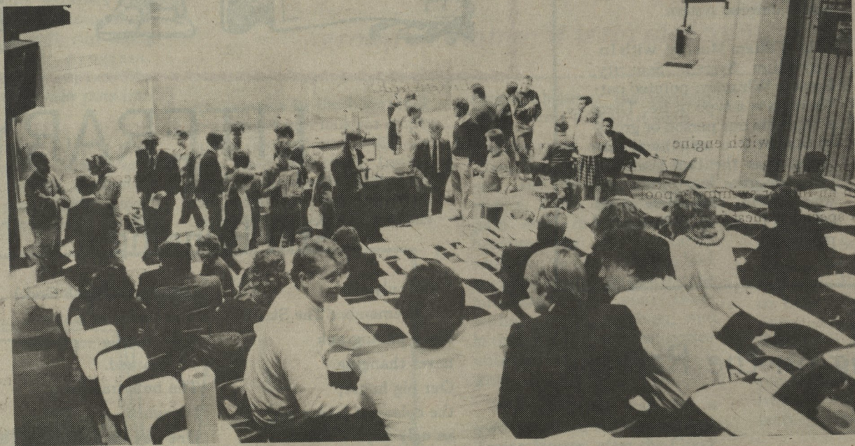
Break at Dalhousie Invitational Debating Tournament