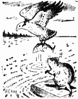
This time Plunger got his fish, and it was a big fish.

That first plunge that had frightened Jerry so he had been out of luck. The fish had been too deep in the water. Twice, as Jerry watched, Plunger shot down only to check himself before reach-