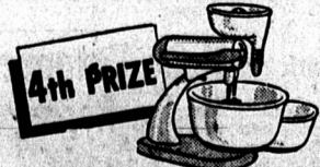
4th PRIZE SUNBEAM MIXMASTER—All mixing speeds plainly indicated. Easy to see—easy to set.