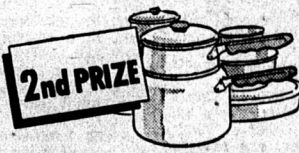
2nd PRIZE SUPREME DE LUXE ALUMINUM KITCHEN UTENSILS—Complete 20 piece set—everything from a heavy duty Master Cooker Dutch Oven, and Aluminum Kettle to Cake and Pie Pans.