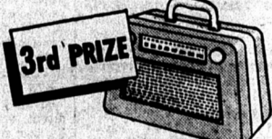
3rd PRIZE WESTINGHOUSE "RAMBLER" RADIO Portable Radio, handsomely finished, extra powerful. Runs on AC or DC current or on its own battery.