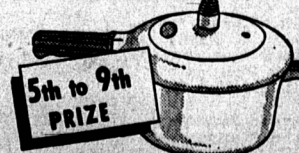
5th to 9th PRIZE PRESTO ALUMINUM PRESSURE COOKER—3 1/2 imperial quart capacity. Reduces cooking time 75%.