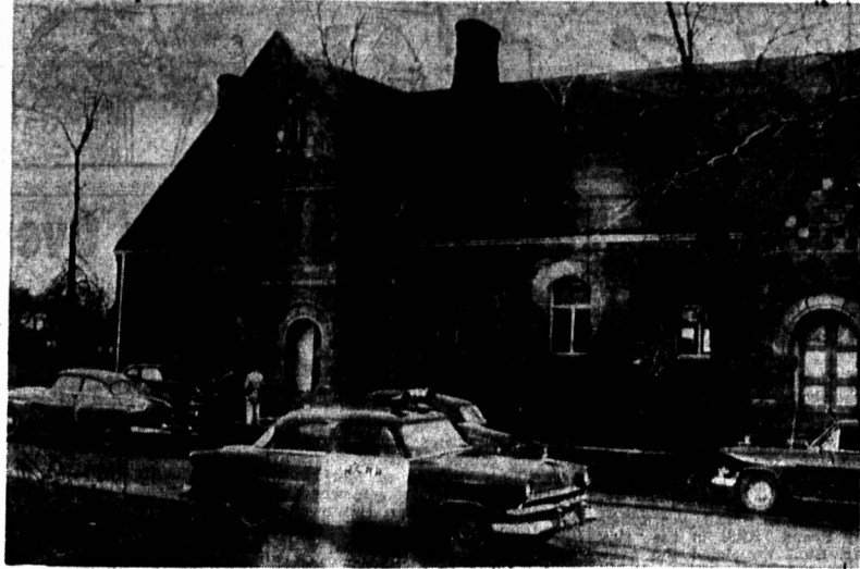
Picture above is the Georgetown Court House and Jail, from where prisoners were removed over the week-end to Charlottetown and Summerside jails. The action followed discovery of a sawed-off bar in one of the cells on the ground floor.