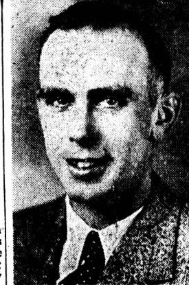
HON. EUGENE CULLEN Minister of Industries and National Resources

On Friday evening a number from Fredericton attended service