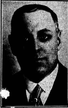
HON. T. W. L. PROWSE Lieutenant-Governor