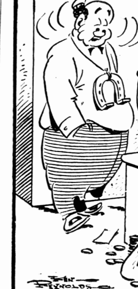
"... of course, I use Guardian Want Ads too!"