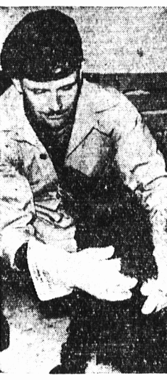
the signing of the register.