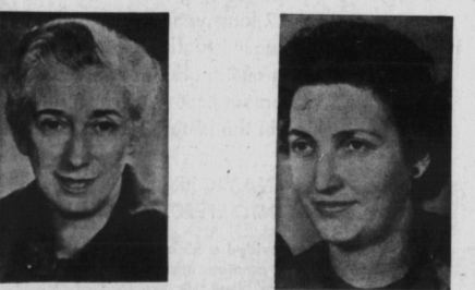
Hon. Ellen Fairclough