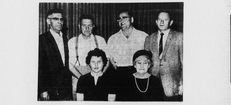
Shown above staff of New Morell Creamery