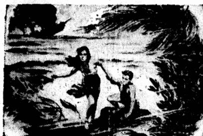
THRILL to the unmatched fury of the hurricane!

J. ARTHUR RANK presents JEAN SIMMONS DONALD HOUSTON