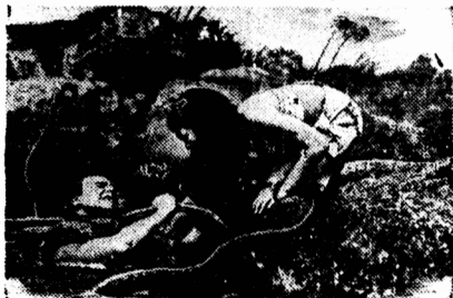
MAN AGAINST OCTOPUS! ... in a hand-to-hand battle to the death!