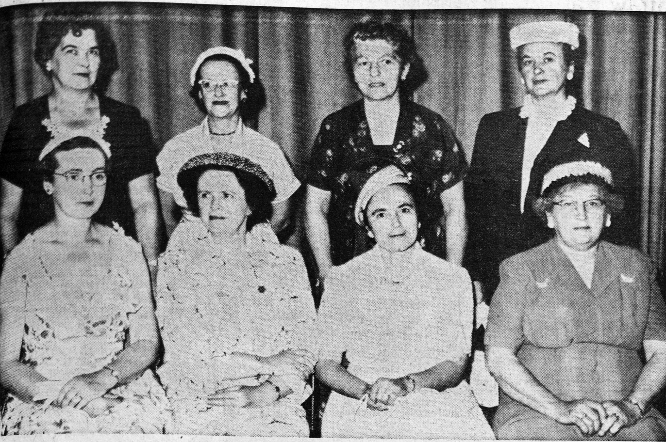
WOMEN'S INSTITUTE OFFICERS