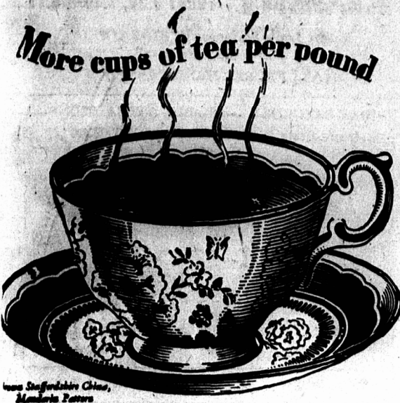
from Staffordshire China, Made in England