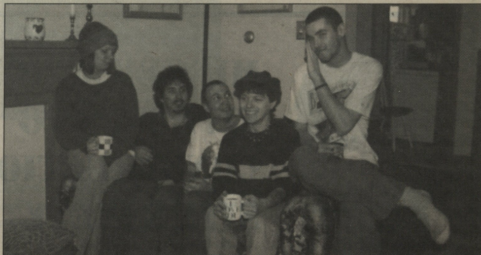
The Eyes for Telescopes.

Keep your eyes on newsstands on campus next year for Hey Alright , and be sure to check out Eyes for Telescopes at Baba's Lounge on April 18 and 26.