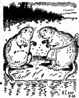
There's no sense in it! declared Mrs. Jerry.

Peter Rabbit was sitting under a big fern very near the Smiling Pool. He was quite hidden. It was a favorite place of his. Peter likes to see without being seen. And here he could see all over the Smiling Pool without anyone suspecting that he has a way of doing when sitting still. He was awakened by rather sharp squeaky voices. He peeped out from beneath the fern. Jerry Muskrat and Mrs. Jerry were just climbing out on the roof of their house out in the water. They were arguing. They were not quarrelling, just giving voice, squeaky voice, to their own opinions.