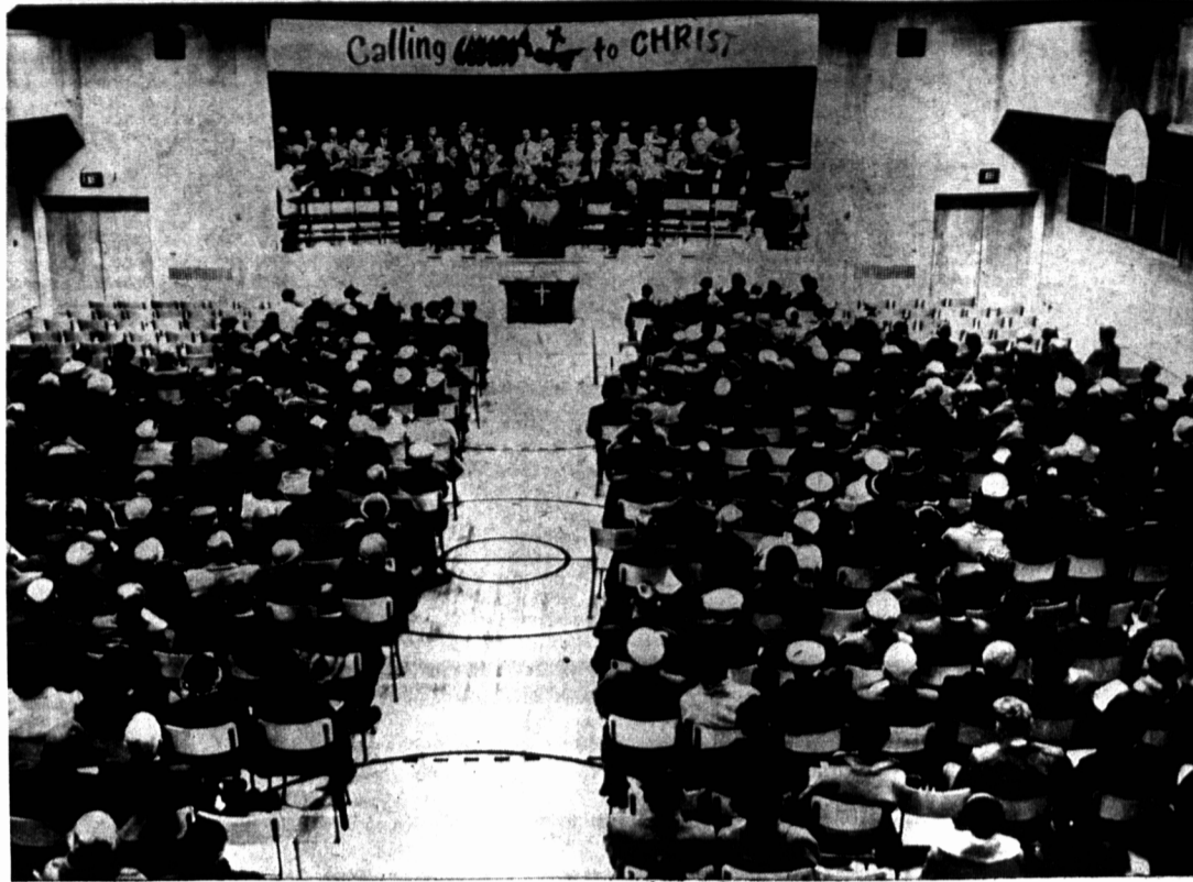
UNITED CHURCH MISSION AT SUMMERSIDE