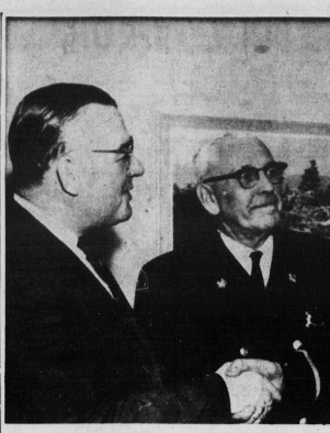
FIREMAN HONORED AT BANQUET