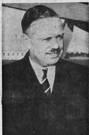
Hon. Donald Fleming