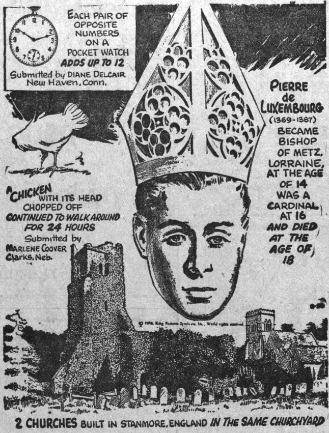
2 CHURCHES BUILT IN STANMORE, ENGLAND IN THE SAME CHURCHYARD