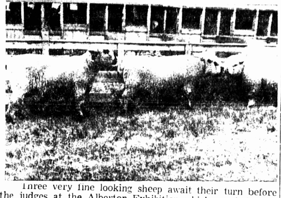
Three very fine looking sheep await their turn before the judges at the Alberton Exhibition which concludes today.