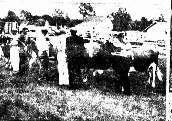
One of the Guernsey classes is seen during the judging yesterday at the Alberton Exhibition. The official opening of this exhibition will take place this afternoon.