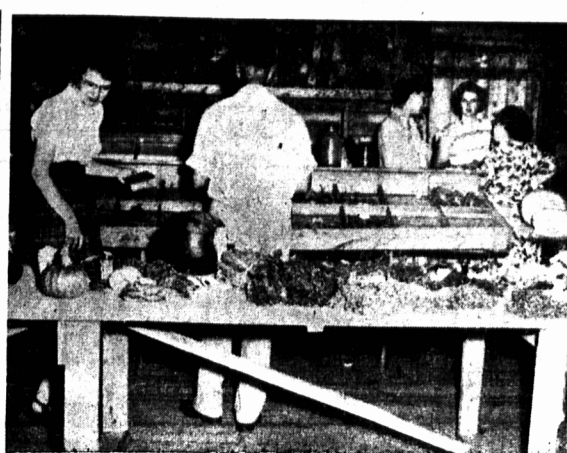
A part of the field roots and vegetable exhibits at the Alberton Exhibition are seen yesterday being viewed by a few of the people who passed through this building to look at the many and interesting exhibits.