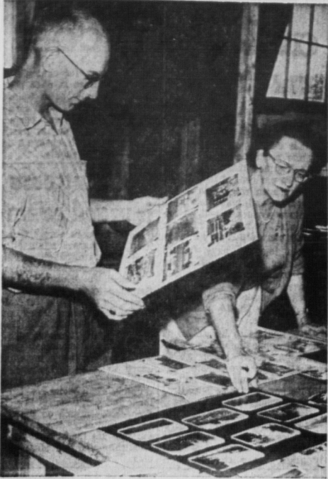
PHOTOGRAPHS ARE JUDGED