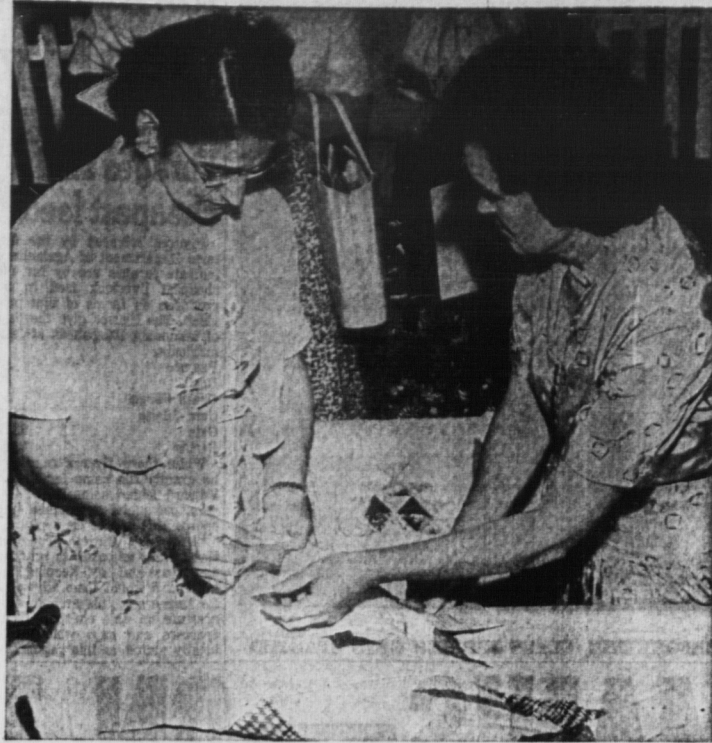
HANDICRAFTS DISPLAY IS GIVEN WIDE ATTENTION