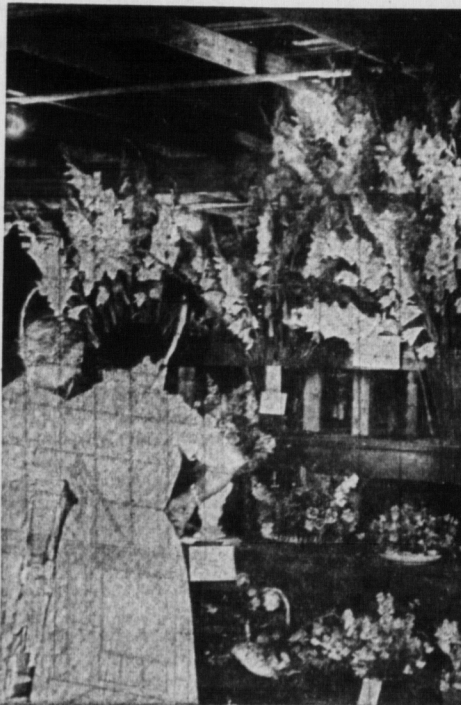
FLORAL DISPLAY IS IMPRESSIVE