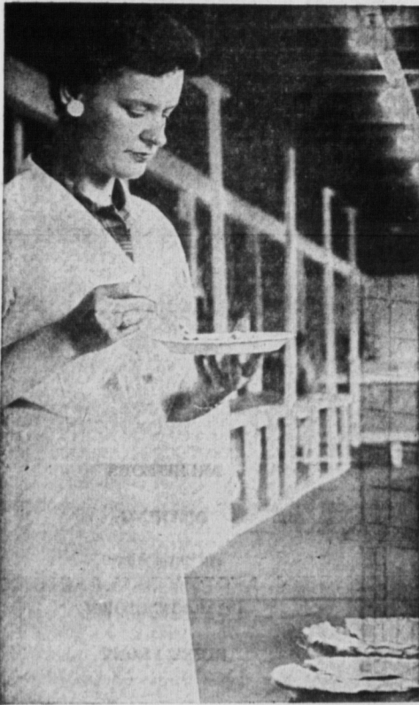
A TASTY PRIZE WINNER