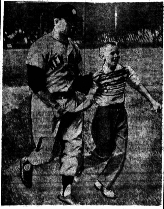
MANTLE DOES IT AGAIN

The Charlottetown Guardian, Saturday, June 23, 1956