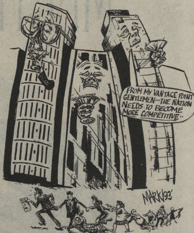
The Ulysses

THE PERSONALS HAVING LIVED ALONE FOR 10, THESE PAST SIX YEARS, I HAVE DEVELOPED A FEW IDIOSYNCRASIES. BEING OUT OF ANY KIND OF RELATIONSHIP FOR THAT LONG HASN'T HELPED. LACK OF FEEDBACK LEADS YOU TO THINK ANYTHING GOES.