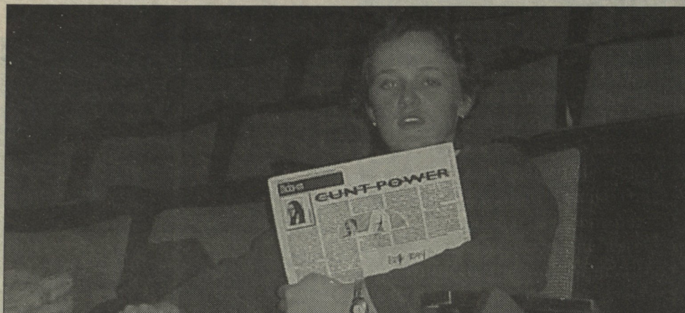
The Vagina Monologues shows dumb men what being a woman means.

She moves her soft hand down to unfasten her dark brown belt. She slips out of her faded blue-jeans and slides her hand underneath her wet panties, and she begins to enter her vagina with long female fingers, faster and faster and faster and, yes, she's very much enjoying it. Is this an immoral act? Is this despicable? disgusting? wrong? Why is it that a guy can masturbate and admit to it, when a woman will repeatedly refuse to admit to masturbating?