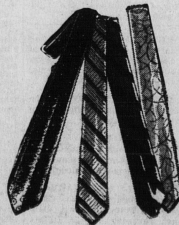
men's dress ties

A tie for every dad on your list. See our wide selection of regular and ready-knot styles in regular and slim widths. Fancy patterns in hold or muted stripes. Choose from blue, olives, gold, wine and grey. 1.00 - 1.50