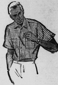
arrow arden dress shirts

Here is a sport shirt that will give dad year around comfort. Long sleeved with button down collar and full button front. Natural tapered body with long comfortable tuck-away shirt tail in sizes S, M, L. Choose from plains, muted checks or stripes in blue, grey, brown and olive. 2.98