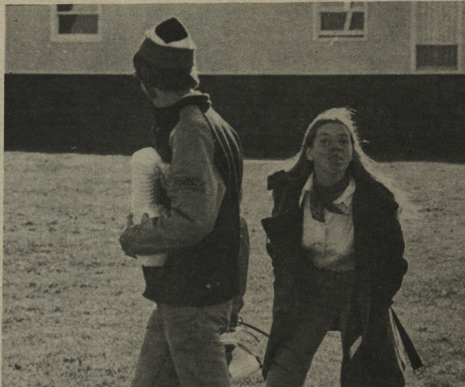
You wouldn't dare

Queen side, or he can castle king side, or he can refuse to castle at all. If he castles king side, the game will generally be a tight defensive game with plenty