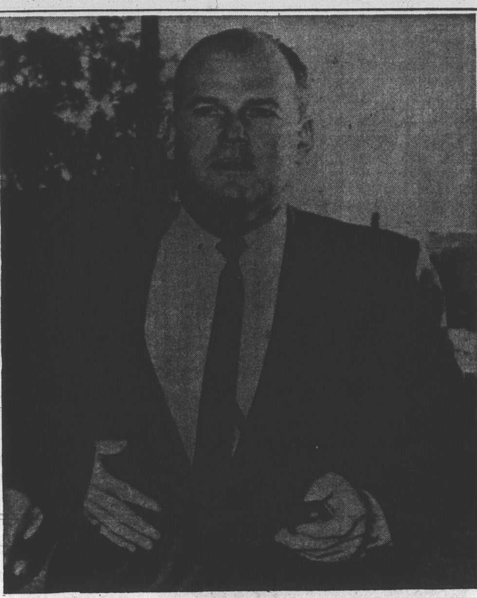
FIRST DAY Samuel R. Sheppard walks toward the Cuyahoga County Criminal Court Building yesterday for the first day of his murder retrial. Sheppard was convicted 12 years ago in the slaying of his first wife Marilyn, but was released on bond in 1964 on a U.S. District Court ruling later upheld by the U.S. Supreme Court. He is being tried again, this time for second-degree murder.