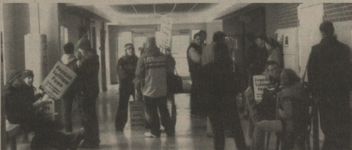
Close to three dozen people showed up