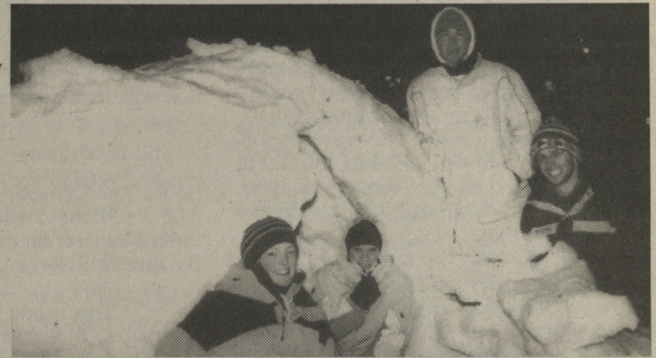
A big igloo, with four protest-campers

Though a cap on tuition for next year is part of the request, the Student Union would also like to see government