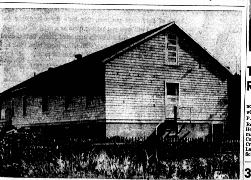
THE SUMMERSIDE Y CENTRE

PUBLIC WARD BASIS The plan was based on public ward care. However, additional