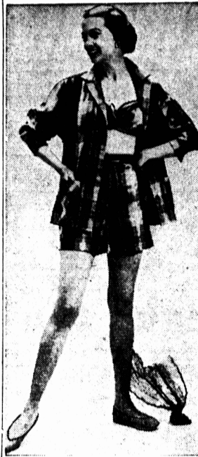
By ALICE ALDEN

GRAND and glorious they are, these new sunning and surfing outfits that California knows how to do so well. Sanforized gingham is used for this one, functional and fashionable. The coat has nice, big patch pockets, the bra and shorts are well-cut and tailored, allowing for plenty of movement yet smartly lined. Bizarre fashions seem to be out of bounds at the best beaches this year, which is all to the good. Sun-fun clothes are pretty yet functional and very easy to care for.