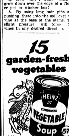
HEINZ VEGETABLE SOUP