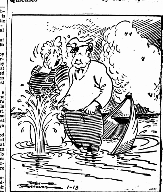
"... don't just stand there — look in the Guardian Want Ads for a plumber!"