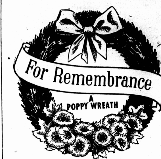
Inserted by the Charlottetown Branch, Canadian Legion.

executors: they saved but did not publish his papers.