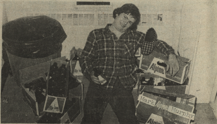
Your middle name becomes Alpine.