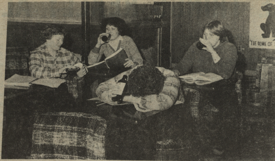
You show up for class in the Barn.