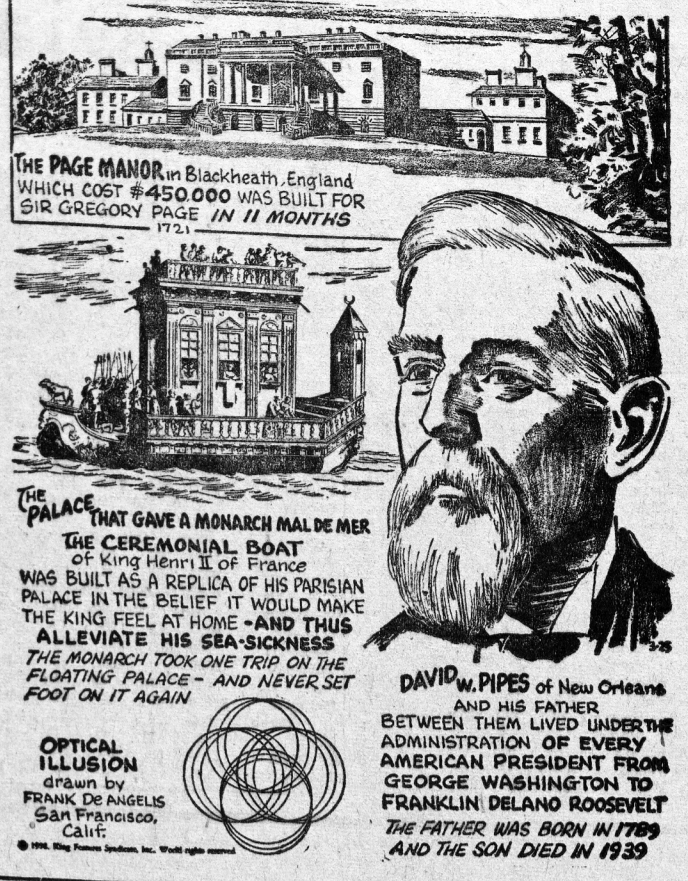
THE PALACE THAT GAVE A MONARCH MAL DE MER THE CEREMONIAL BOAT OF King Henri II of France WAS BUILT AS A REPLICA OF HIS PARISIAN PALACE IN THE BELIEF IT WOULD MAKE THE KING FEEL AT HOME - AND THIS ALLEVIATE HIS SEA-SICKNESS. THE MONARCH TOOK ONE TRIP ON THE FLOATING PALACE - AND NEVER SET FOOT ON IT AGAIN.