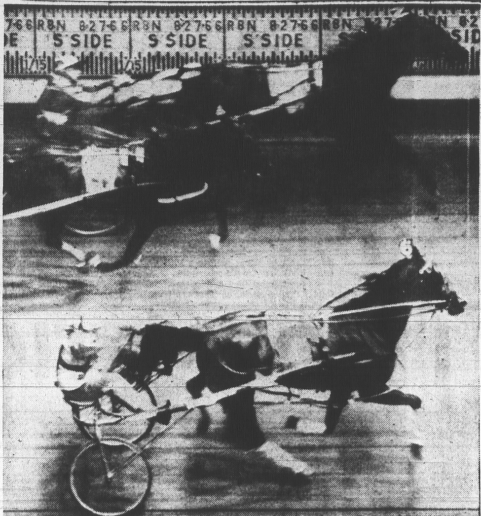
KNIGHT NORRIS, HELEN'S DREAM IN DEAD HEAT

RACES 4 AND 8 Knight Norris (J. Chappell) 2 1DR Rio Grande (G. Chappell) 1 3 Helen's Dream (H. Poulton) 5 1DR Mr. Charmer (W. Henderson) 3 5 Name The Price (C. Smith) 6 4 Grattan Abe (W. Waite) 4 7 Silver Glengie (W. Companion) 7 6 Babe Clegg (B. Whalen) 8 8 Times: 2:13, 2:15-2. Pays: $8.10, 4.10, 4.10, 4.30.