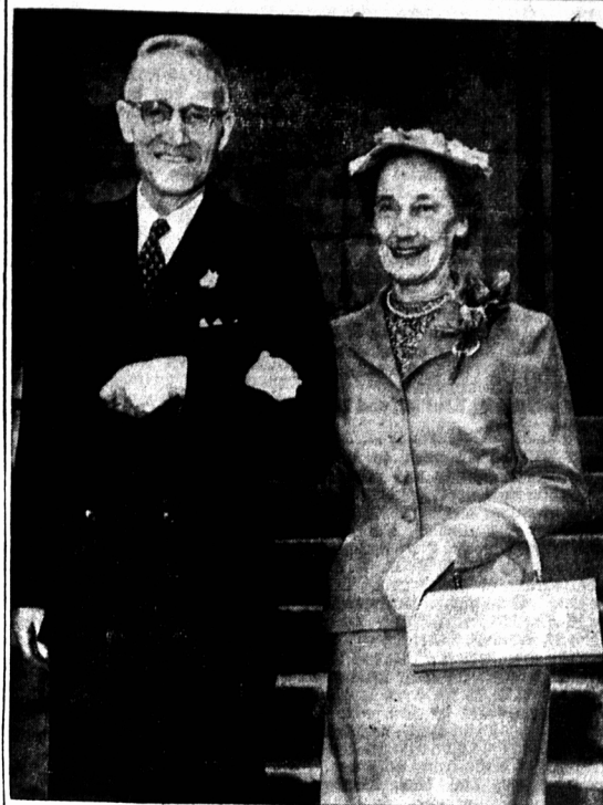
WEDDING BELLS FOR MP

Wed., April 4, 1956 The Guardian, Page 9