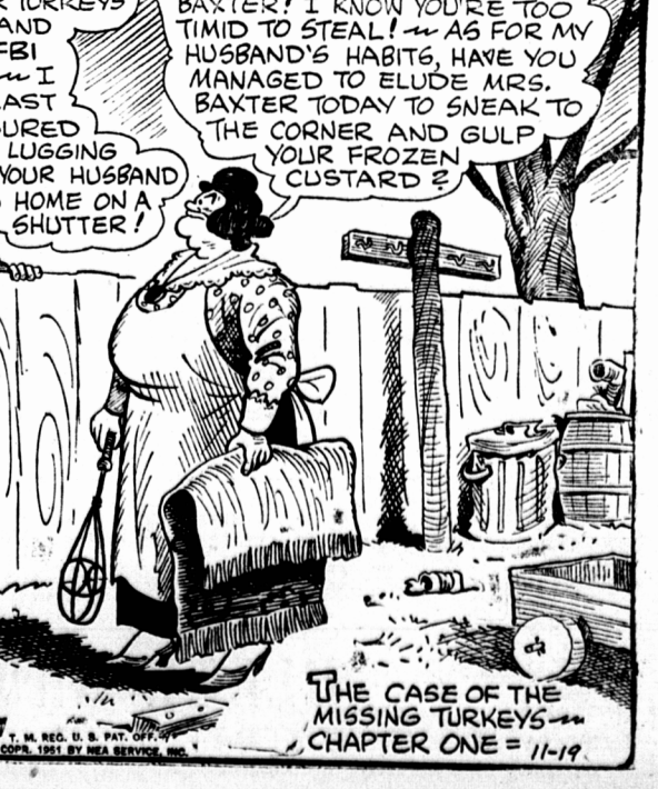
THE CASE OF THE MISSING TURKEYS CHAPTER ONE = 11-19.