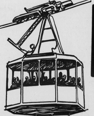
this Alpine cable-car

lets you off by the banks of the romantic Seine... to see budding artists at work, or around the corner to discover the Louvre's myriad treasures. Take another bus from the downtown egeorge to the aeroport... then let to the sunny Riviera, where a rendezvous with Mediterranean fun awaits you.