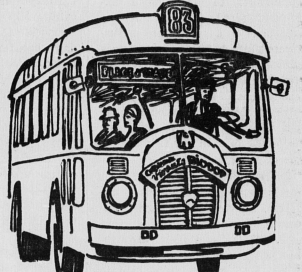
this Paris autobus

takes you through the bustling West End to gay, lively nightspots; to keep a business date in The City... or to a busy British Railways station where your train speeds you to Shakespeare's birthplace. Or along the scenic Cornish coastline, where palm trees grow (yes, in Britain!)