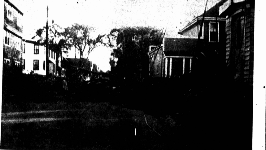
Richmond Street West where two poles were broken and high power wire circuit disrupted. Barter's Film Lab.