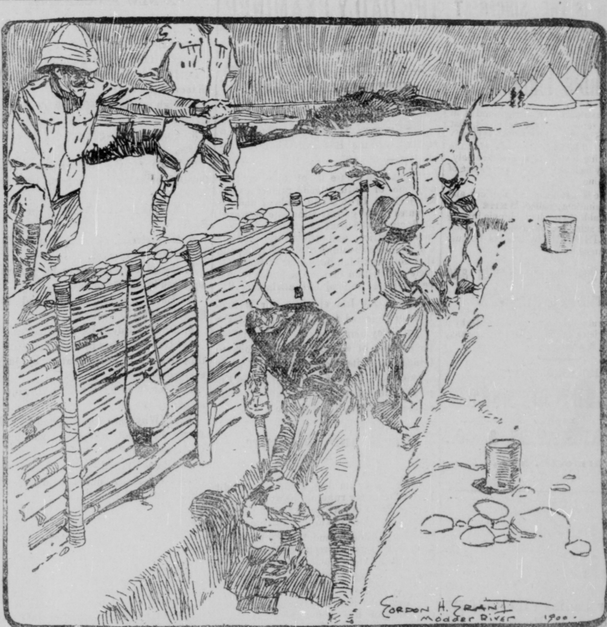
PUTTING THE MODDER IN DEFENSIVE ORDER AGAINST BOER REAR ATTACKS. In his campaign of advance Lord Roberts has also been especially careful to protect his line of communication in pursuance of that plan the Modder river, which flows around the north and east of Bloemfontien, has been strongly fortified. The brush to the left of the picture marks the river bank along which breastworks are being put up to protect the garrison that shall be left after the column has advanced.