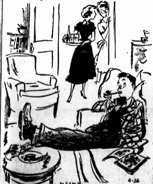
"First he played hard to get, now he's playing hard to get rid of."