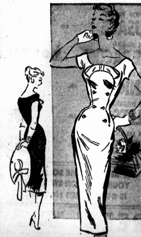
PATTERN A686 by Oleg Cassini