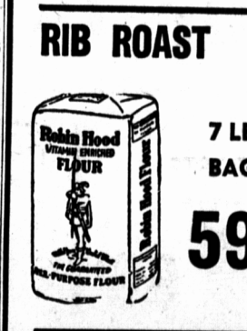
7 LB. BAG 59c

GOOD BETTER BEST When you buy a piece of meat you look for a REASONABLY PRICED piece to give you the most meat value. You also look for meat that will be TENDER and TASTY. Now when a person tells you that a piece of meat is Government inspected and therefore it must be good he is right insofar as the Government means that it is good enough for human consumption. When you are buying meat don't be satisfied with just passable meat— INSIST ON THE BEST