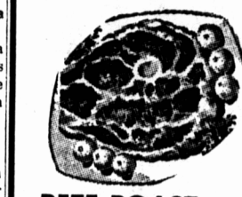
BEEF ROAST Shoulder-Blade Lb. . . . . 45c

NEW! BABY'S OWN COUGH SYRUP made especially for babies. Soothing—quickly relieving. Pleasant. Won't upset digestion.