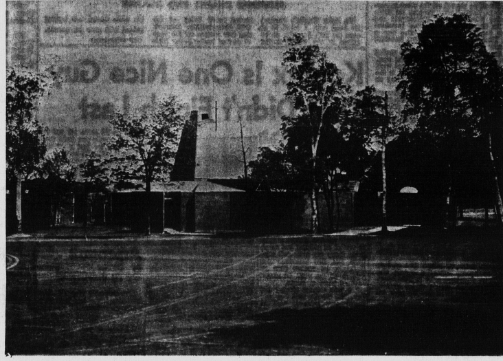
Holy Redeemer Church