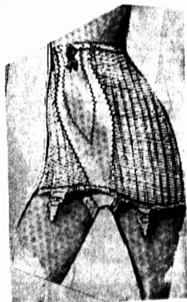
Ladies' Shop Ch'town

Snap In The Crotch --- It's A Panty Snap It Out --- It's A Girdle