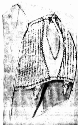
Ladies' Wear S'ide