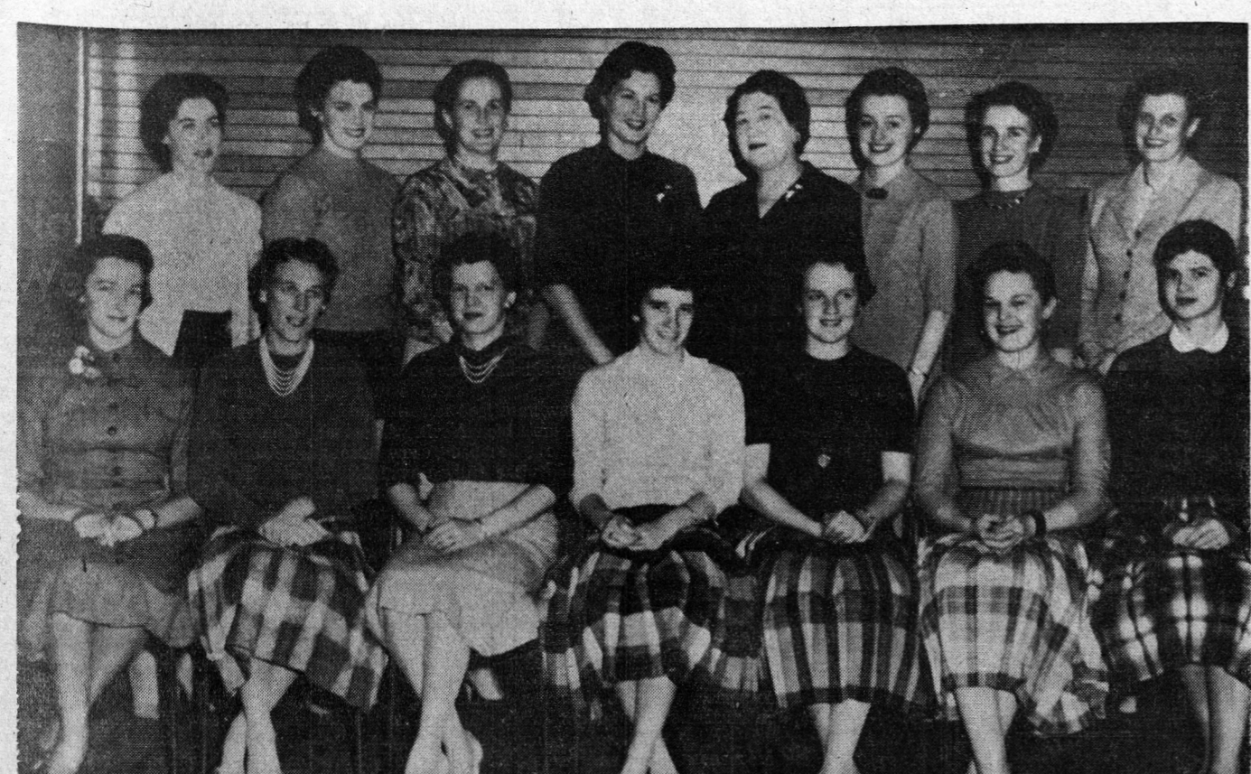
MODELS FOR PARADE OF SPRING FASHIONS