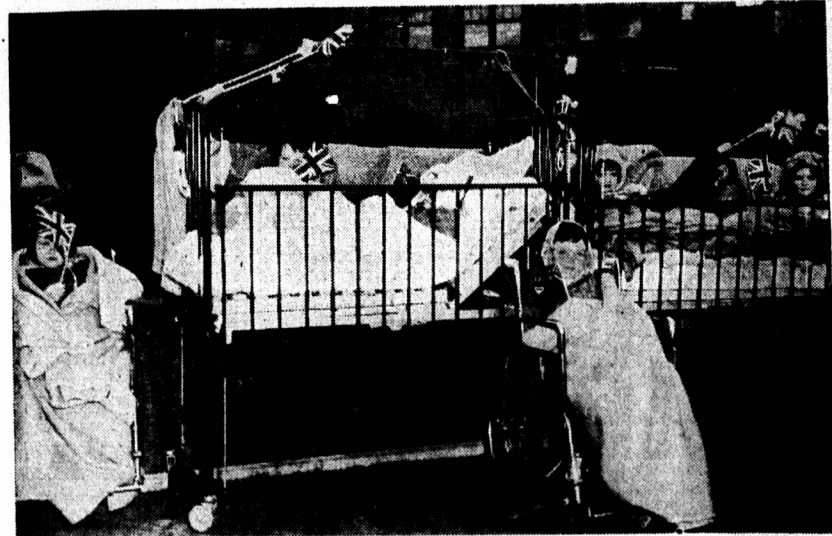
Little patients from the Polio Ward of the Provincial Sanatorium, warmly bundled-up, complete with flags prepare to greet the Royal Couple.