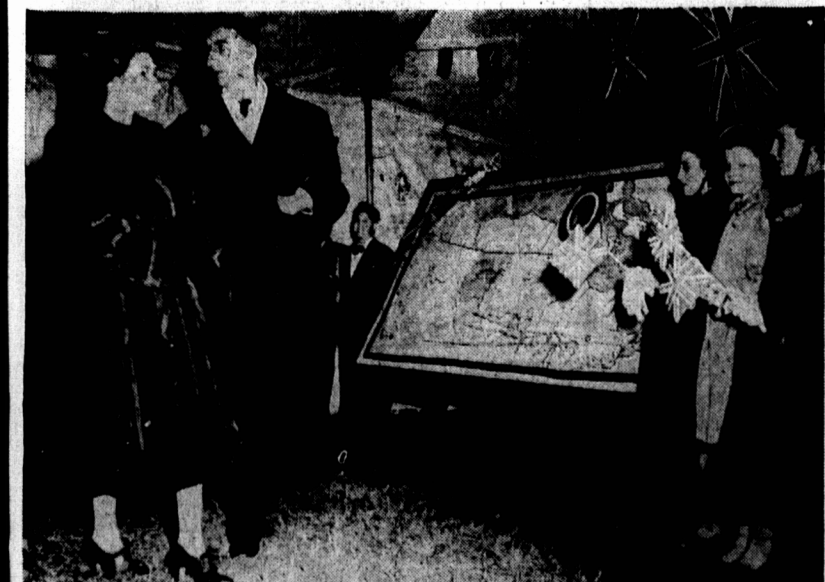
Princess Elizabeth examines a large scale map of Canada showing the itinerary of their tour across Canada prepared by senior pupils of Model School, ages nine to 14 years.