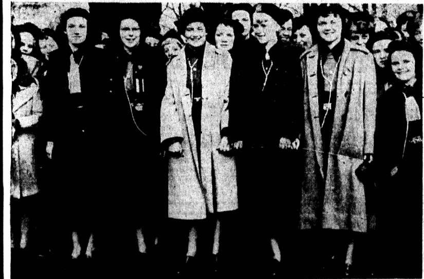
A group of smiling Girl Guides at the Experimental Farm. The five in the forefront received their Gold Cords from the Princess.