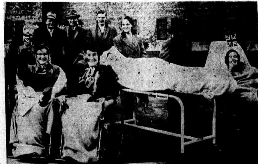
Patients from the Provincial Sanatorium eagerly await the passing of the Royal visitors.